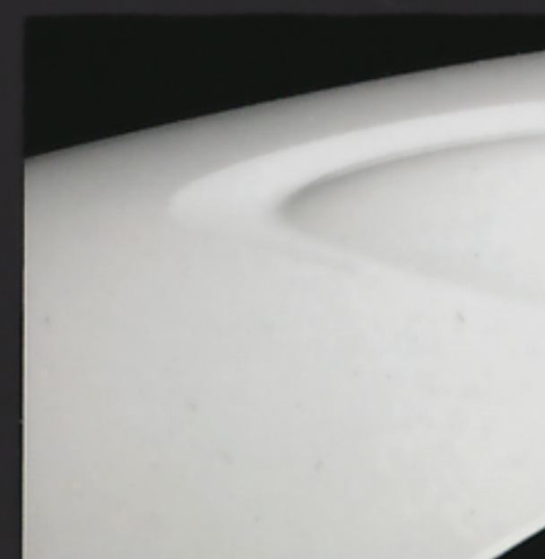
Crystal White Pearllescent