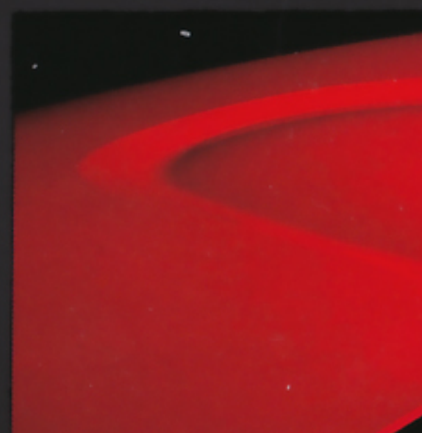
Velocity Red Mica