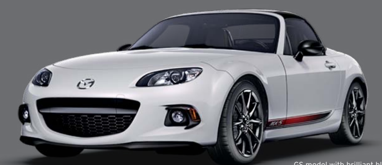
GS model with brilliant black on door mirrors and Power Retractable Hardtor

The MX-5's quick and easy-to-use soft top isn't the only way to embrace the wind. Standard on the GS and GT models is a Power Retractable Hardtop. Precisely designed to take up zero trunk space, the MX-5's ultra-light 36 kg (80 lb) hardtop stores neatly behind the seats under a special tonneau cover. Weather-tight and complete with a solid glass rear window with defroster, the MX-5's roofline is aerodynamic yet elegant. It may be one of the most iconic convertibles in the world, but at the push of a button, it takes a mere 12 seconds to transform the thrill