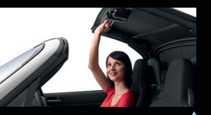
Reach for the sky Opening the Z-folding soft-top is a quick, simple operation.

A winding road in front of you and the sky above you. Driving doesn't get any more enjoyable than this. The only question is, how do you want to get your fresh air thrills? In MX-5 Coupe it couldn't be easier. Press a button and in just 12 seconds the powerretractable roof takes you from coupe-like refinement to the open air. Alternatively, there's the soft-top and its classic Z-fold cloth roof.