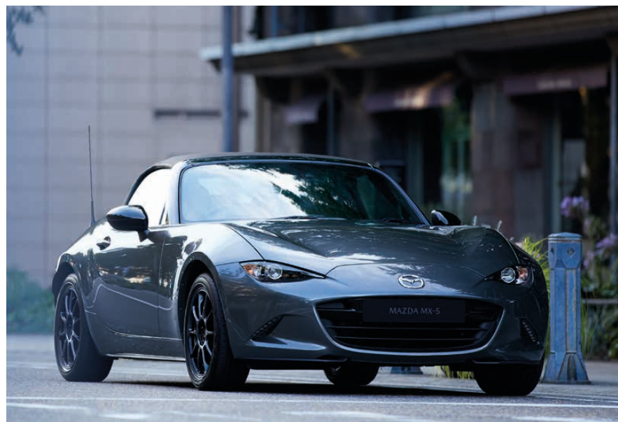
Mazda MX-5 132ps R-Sport finished in Polymetal Grey Metallic paint