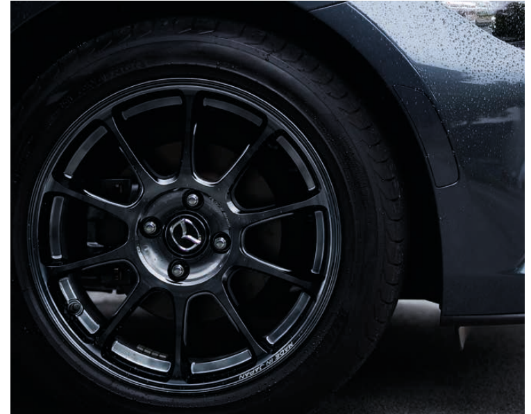
Mazda MX-5 132ps R-Sport finished in Polymetal Grey Metallic paint