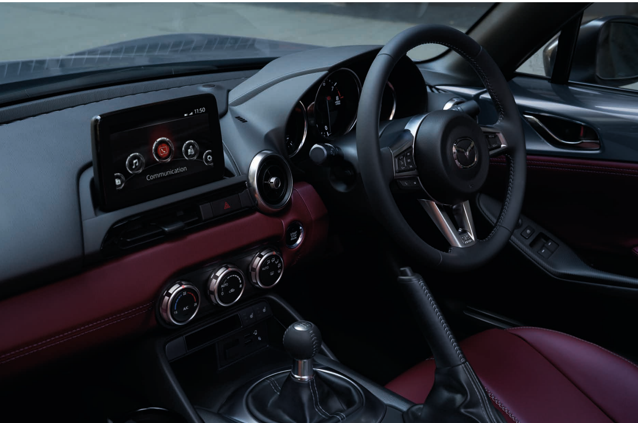
Mazda MX-5 132ps R-Sport featuring Burgundy Nappa leather interior with silver stitching