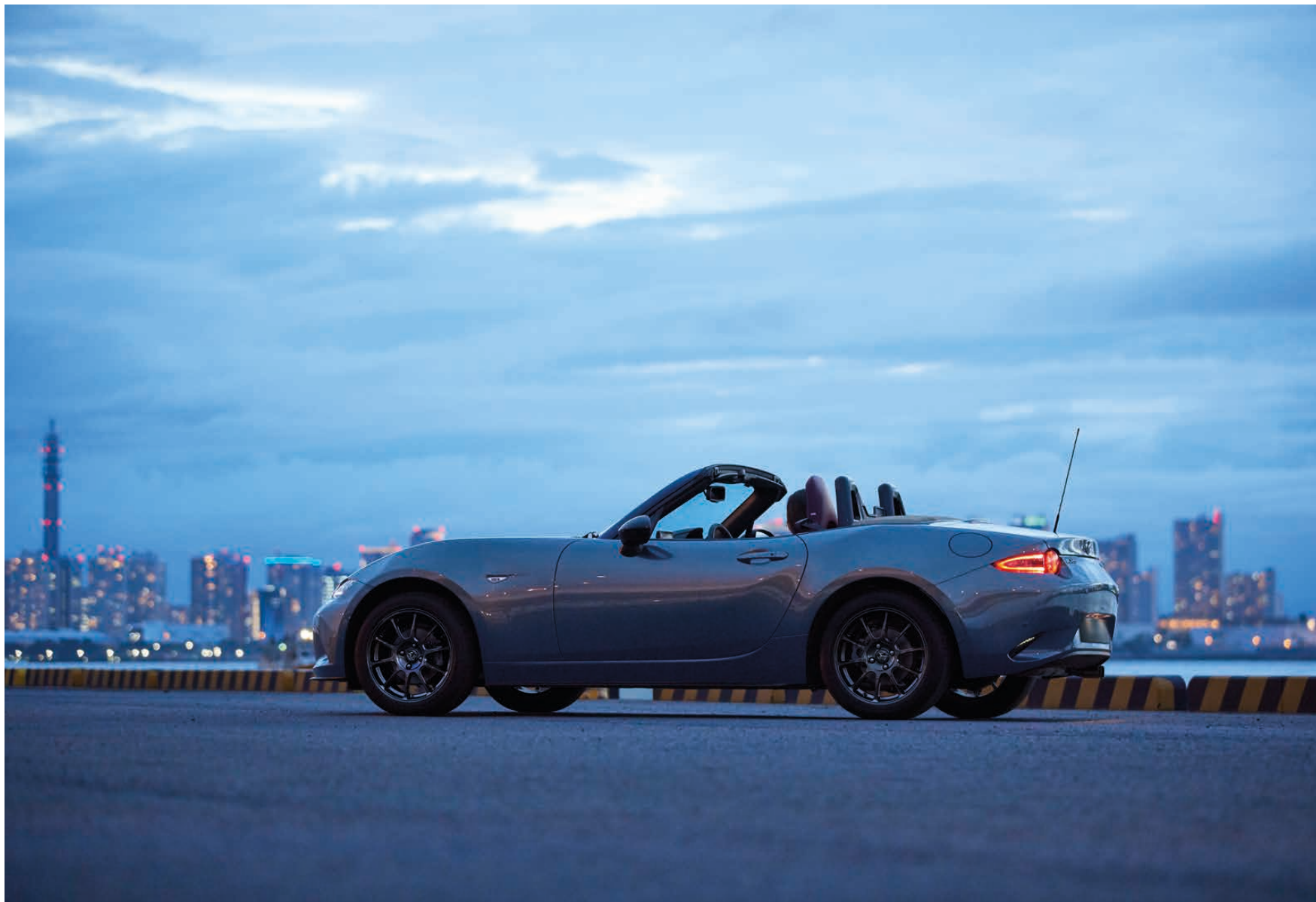
Mazda MX-5 132ps R-Sport finished in Polymetal Grey Metallic paint